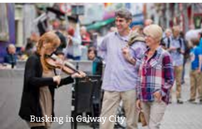
Busking in Galway City