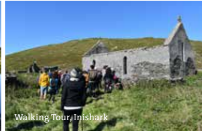
Walking Tour, Inishark