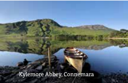
Kylemore Abbey, Connemara