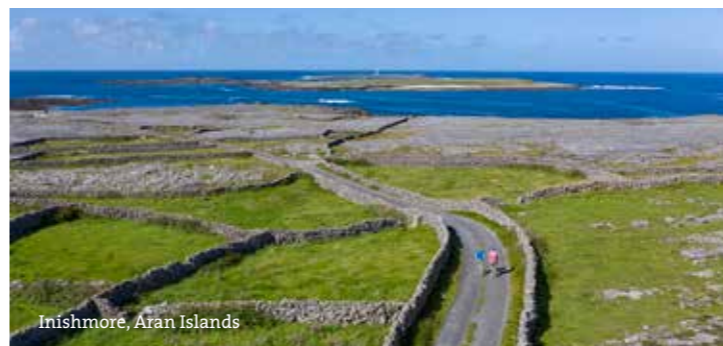
Inishmore, Aran Islands

The Aran Islands - The three Aran Islands are Inis Mór Island (Big Island), Inis Meáin Island (Middle Island) and Inis Oírr Island (East Island). Situated in the heart of Galway Bay, the islands are world famous for their geological formation, linguistic and cultural heritage and historical monuments including the Dún Anoghasa fort. Ferries operate daily to and from the Island from the port of Ros a Mhíl, 23 miles from the City. Shuttle buses operate from the City to the port, pre-booking is advisable during the high season www.aranislandferries.com or telephone 091 568903