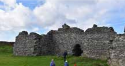
Cromwells Fort, Inishbofin