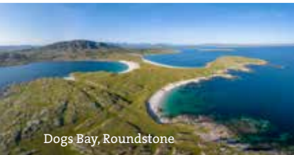
Dogs Bay, Roundstone

GALWAY TOURIST INFORMATION CENTRE Galway City Museum, Spanish Parade, Galway, H91 CX5P. Tel: 1800 230 330 E. irelandwestinfo@failteireland.ie W. www.discoverireland.ie/places-to-go/visit-galway