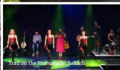
Trad on the Promenade, Salthill