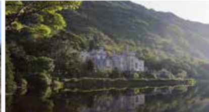
Kylemore Abbey, Connemara