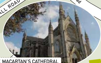
ST. MACARTAN'S CATHEDRAL

Some of the Information and imagery used within these panels has been used courtesy of Monaghan Tourism and cannot be used in whole or part without prior written permission from the publishers. For more information on the Town and County of Monaghan please log onto www.monaghantourism.com or check out their facebook page www.facebook.com/monaghantourism . Whilst every care has been taken to ensure that all the information contained in this publication is correct, Condor Publishers Ltd. cannot accept responsibility for any errors or omissions which may have occurred. All information contained in this publication is strictly copyright and may not be reproduced in whole or part without prior permission of the Publishers. ©2020